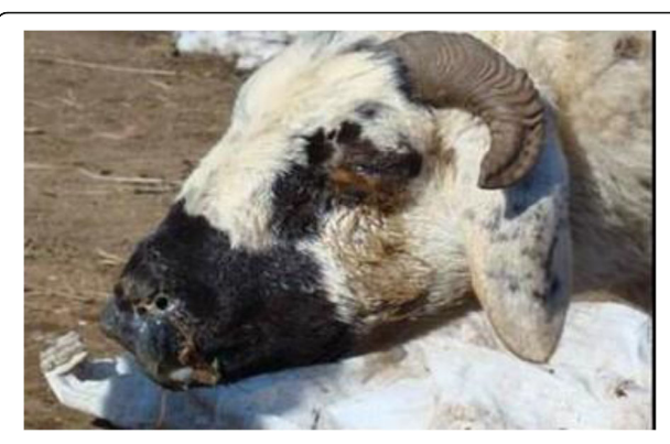
Fig. 2 Thick discharges from the nose, nostrils and eyes. Source: (Mirzaie et al. 2015)

Zewdie et al. Animal Diseases (2021) 1:28 Page 5 of 10