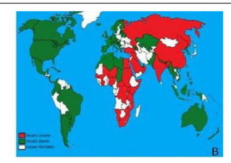
Fig. 1 A Sheep pox geographic distribution. B Lumpy skin disease geographic distribution. The red color indicates the presence of CaPV

were recorded in Bulgaria and Greece, Israel in 2014, and Russia and Mongolia in 2015 (Tuppurainen et al. 2017). In Ethiopia, very limited investigations have been conducted on sheep and goat pox virus in selected parts of the country (Gari et al. 2015). However, the diseases have a widespread distribution in all regional states of the country and affect the production and productivity of the subsector in the country. In the Gondar veterinary clinic, the prevalence was 40% in sheep and 8.12% in goats (Molla et al. 2017a); in the Gamo Gofa zone of the country, the prevalence was 31.96% in sheep and 35.28% in goats (Kebede et al. 2018). Recently, seroprevalence epidemiological studies have been performed on sheep and goat pox. However, the spatiotemporal clustering of SPP and GTP incidence rates has not been studied (Aregahagn et al. 2021).