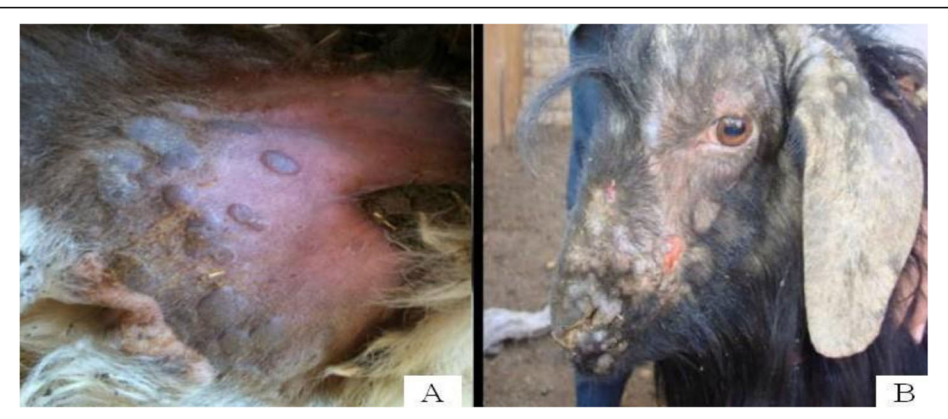
Fig. 4 Popular lesions under the tail (A). Source (Zangana and Abdullah 2013). Pox lesions on the face and ears (B). Source (Mirzaie et al. 2015)

Zewdie et al. Animal Diseases (2021) 1:28 Page 6 of 10