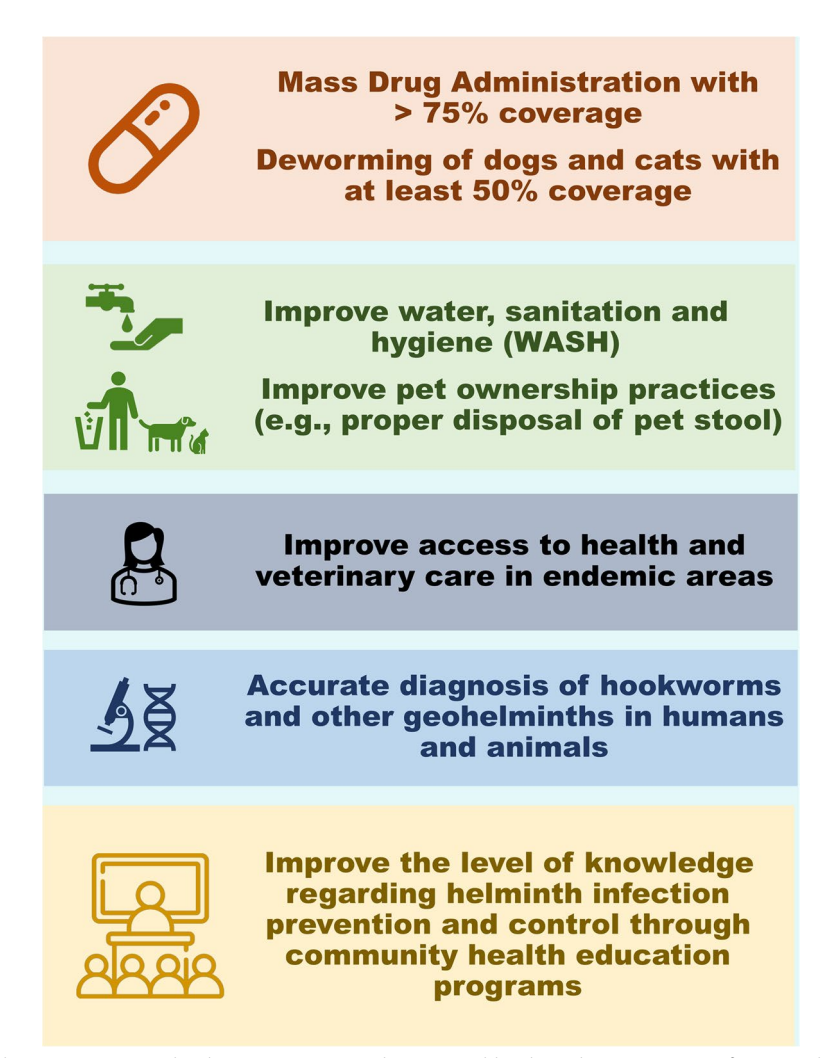
Fig. 2 Controlling and eliminating zoonotic hookworms. Mitigating the One Health risks and consequences of zoonotic hookworm infections may involve clinical treatment and preventive chemotherapy, improving sanitation, improving access to health institutions, advancing diagnostics, and expanding community health education efforts